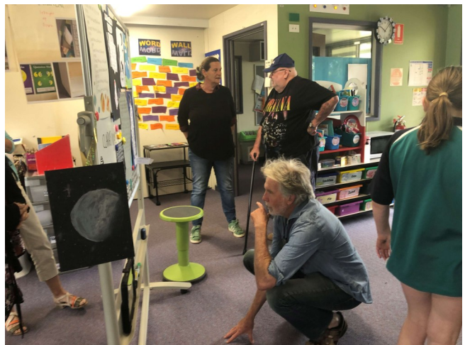
Our Community Open morning to showcase student work.