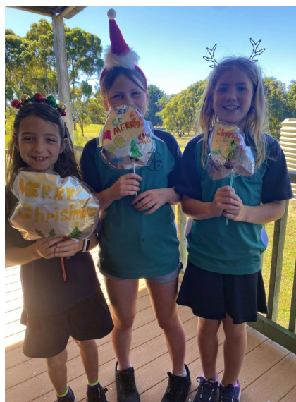
An end of year College concert (on the 42-degree day) as well as some final week activities to celebrate the end of year.